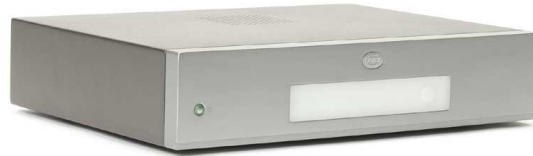
Figure 7-1: IP440 Picture